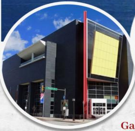
Reginald Lewis Museum