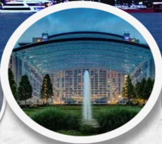
Gaylord National Resort & Convention Center National Harbour, Md.