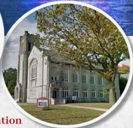
Mount Zion UMC of Baltimore